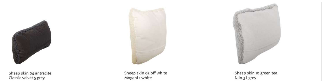
Sheep skin 04 antracite Classic velvet 5 grey