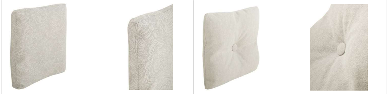
CUSHION WITH PIPING